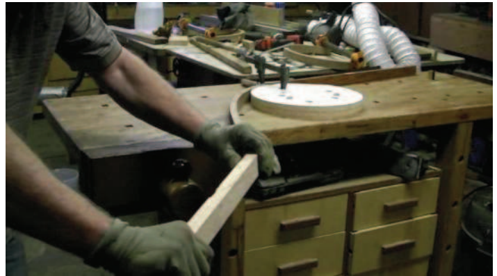
Bending the steamed wood around the form.

Early steering wheels were usually made with a wooden rim fastened to a metal spider. These were sometimes made from six or eight sections finger-jointed together or they were made out of one or two steam-bent sections. This one was made with two laminated sections finger-jointed together. This presented a number of interesting woodworking challenges.