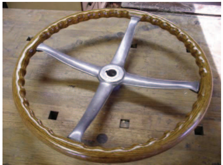
The finished steering wheel.

See http://www.youtube.com/watch?v=8mgM9wBKyU8 for my You Tube video on this project.