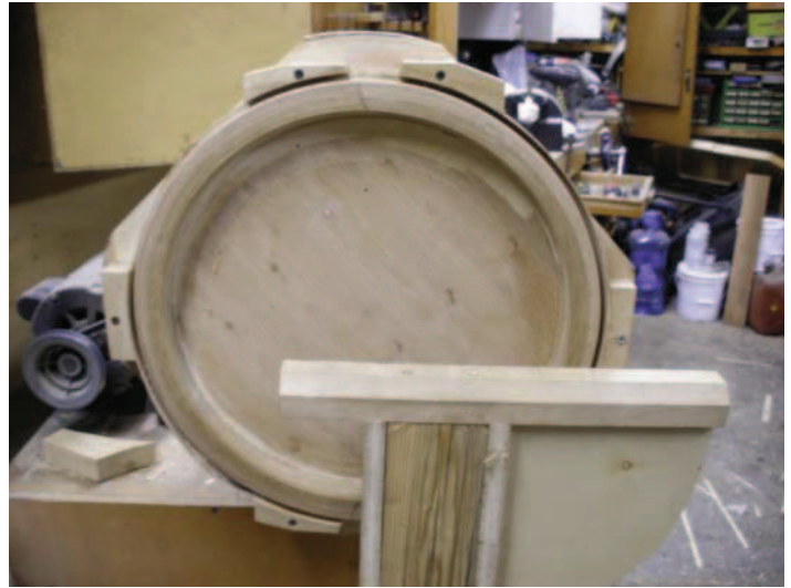
Turning the rim on the lathe.

With the finger-joints cut, the two halves were glued together. Glue blocks were glued to the half-rims so that they could be clamped securely.