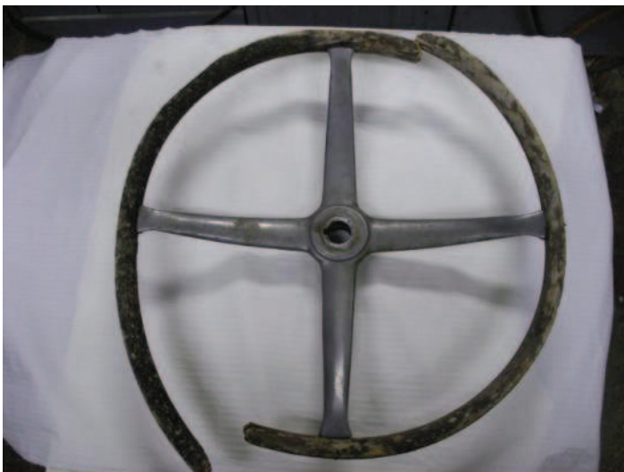
The original steering wheel.

To make the rim I needed four pieces of oak each 5/8" x 1 1/4" by 60". I steamed each piece about 80 minutes and bent them