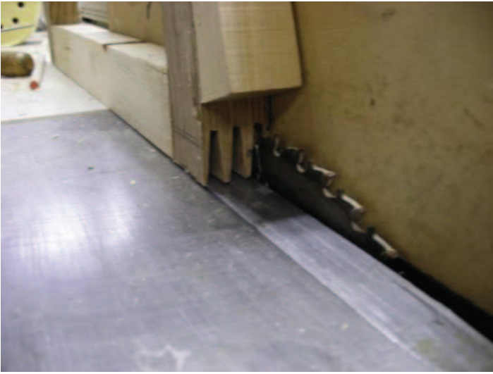
Cutting the finger-joints on the table saw

around my forms which I securely bolted to my work bench. I needed two forms, the outside piece needed to be a bit bigger than the inside. When they were done I laminated the inside and outside pieces together with urethane glue. You have to be really careful when you use this stuff since it's impossible to get off your hands.